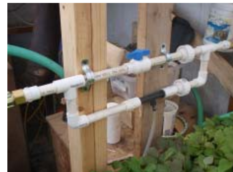
Inline Fertilizer Injector