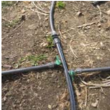
Manifold with T-tape branches