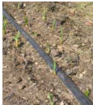
T-tape line in new garlic bed