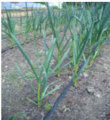
Healthy stand of garlic in July with T-tape line