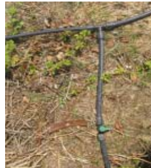
Manifold with T joint and shut off valve