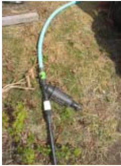
Y-Filter in manifold line